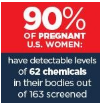
IMAGE: This is a graphic highlighting the percentage of pregnant women with detectable chemicals in their bodies. <u>view more</u>

University of California - Davis Health System